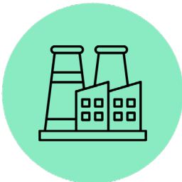
Manufacturing and Processing