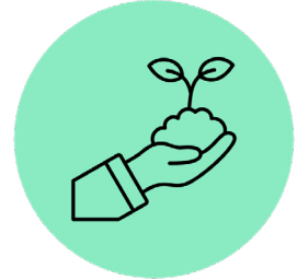
Forestry and Agriculture