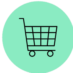
Retail and Distribution