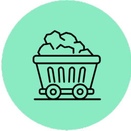
Mining and Materials

Proteus convenes businesses from across sectors and value chains that interface with biodiversity. These include mining, infrastructure, renewable energy and utilities, manufacturing, agriculture, food and beverage, forestry, automotive and pharmaceuticals, among others.