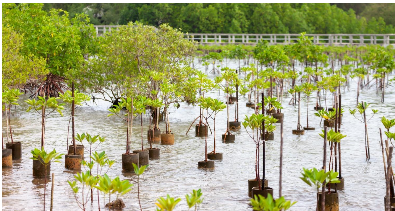
Mangrove restoration project.

Overview of the tools available and opportunities for business to engage and support impact