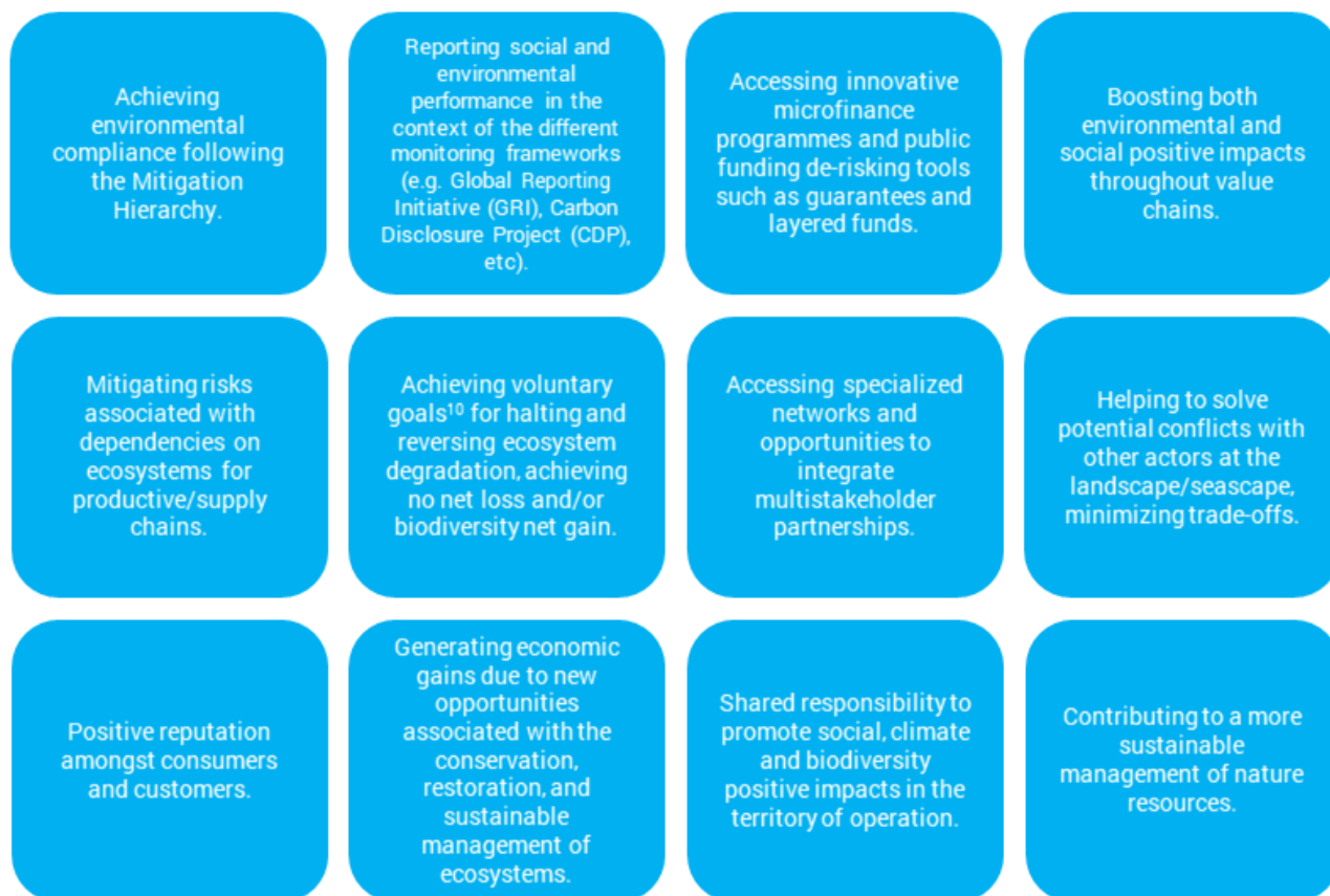
Figure 1: Benefits of engagement by the private sector in the UN Decade.

The UNFCCC COP26 outcomes are aligned with the UN Decade, and call on private sector companies to source only from sustainable sources; to eliminate deforestation from supply chains, and to minimise climate risks by investing in ecosystem conservation and restoration. The UNFCCC COP27, held in 2022 in Egypt, further emphasised the strong links between addressing climate change and biodiversity loss, encouraging parties to consider Nature-based Solutions (NbS) and ecosystem-based approaches in climate change mitigation and adaptation.