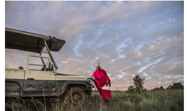
Avoided grassland conversion