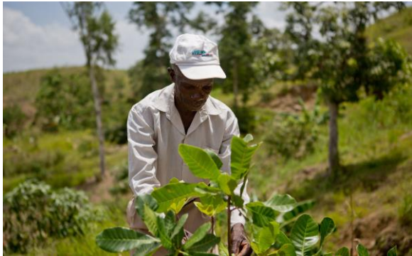
Trees in croplands