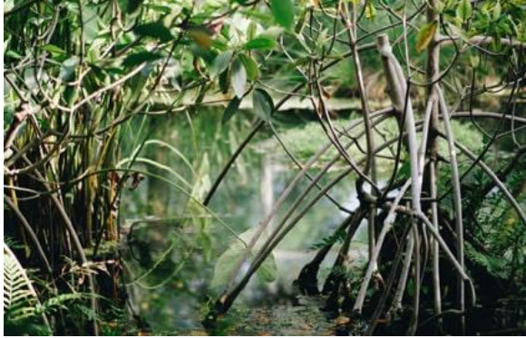
Wetlands' protection and restoration in catchments