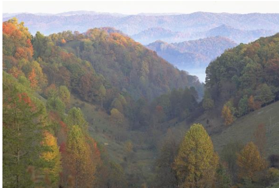
Natural forest management