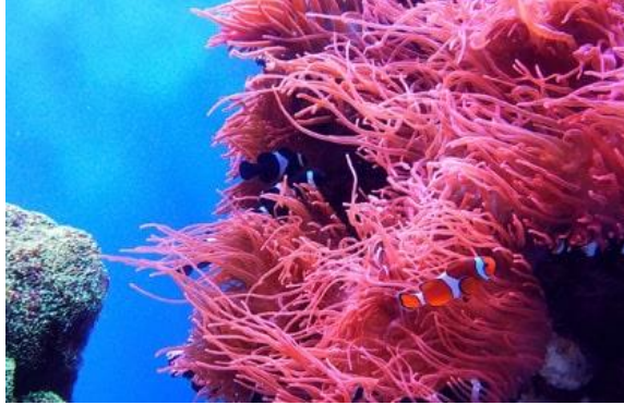
Coastal habitat restoration